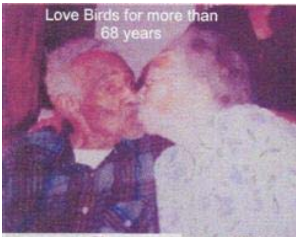
Love Birds for more than 68 years